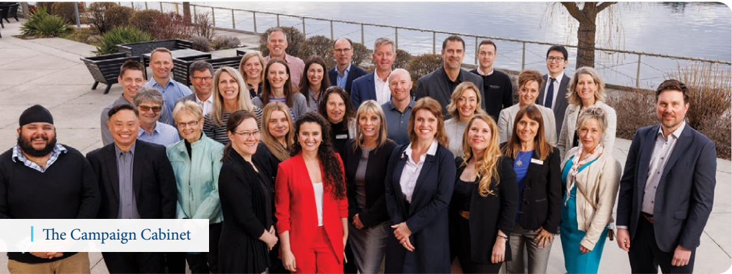
The Campaign Cabinet