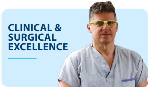
CLINICAL & SURGICAL EXCELLENCE

Thanks to your generosity, we’ve reached 78% of our $40 million goal in our most ambitious fundraising campaign. What makes Closer to Home Than You Think truly powerful is its flexibility and urgency. Guided by the expertise of local physicians and care teams, donations are being put to work immediately across seven priority areas. Because of you, care is being transformed, and lives are changing in operating rooms, clinics, outreach programs, and homes across our region.