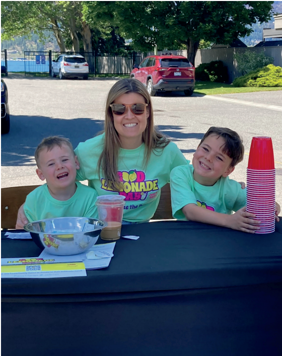
Thank you to everyone involved in this year's Good Lemonade Day! They raised an incredible $26,720 for JoeAnna's House!